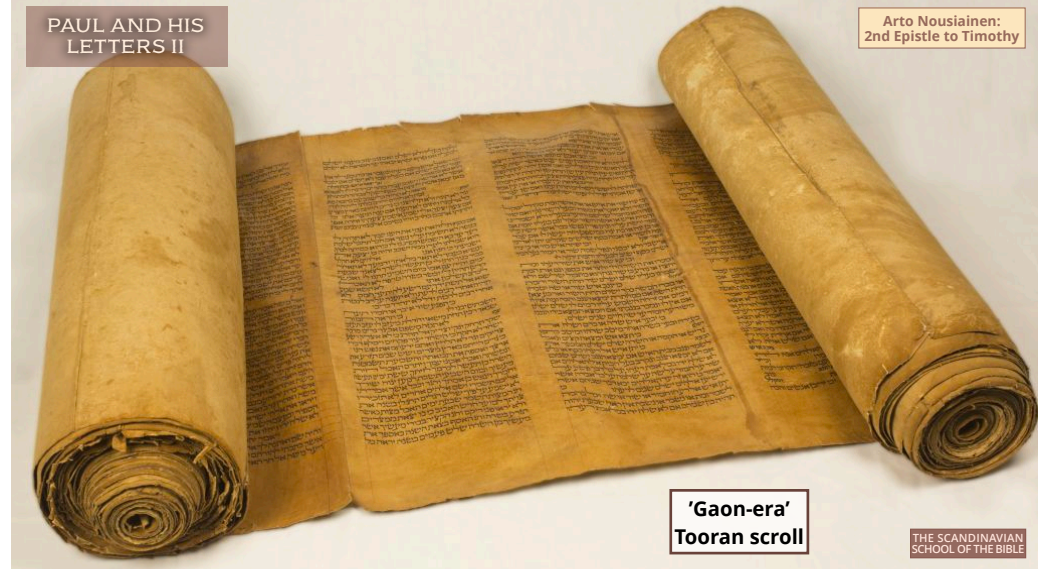
'Gaon-era' Tooran scroll