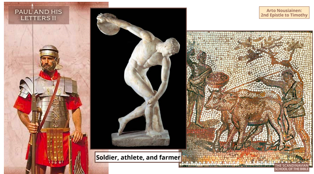
Soldier, athlete, and farmer