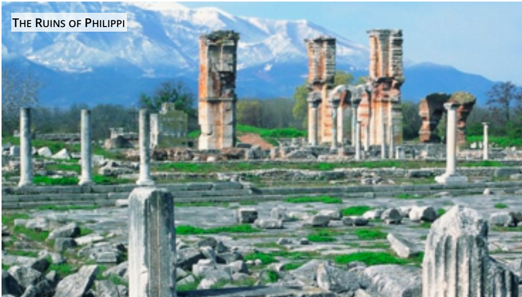
THE RUINS OF PHILIPPI